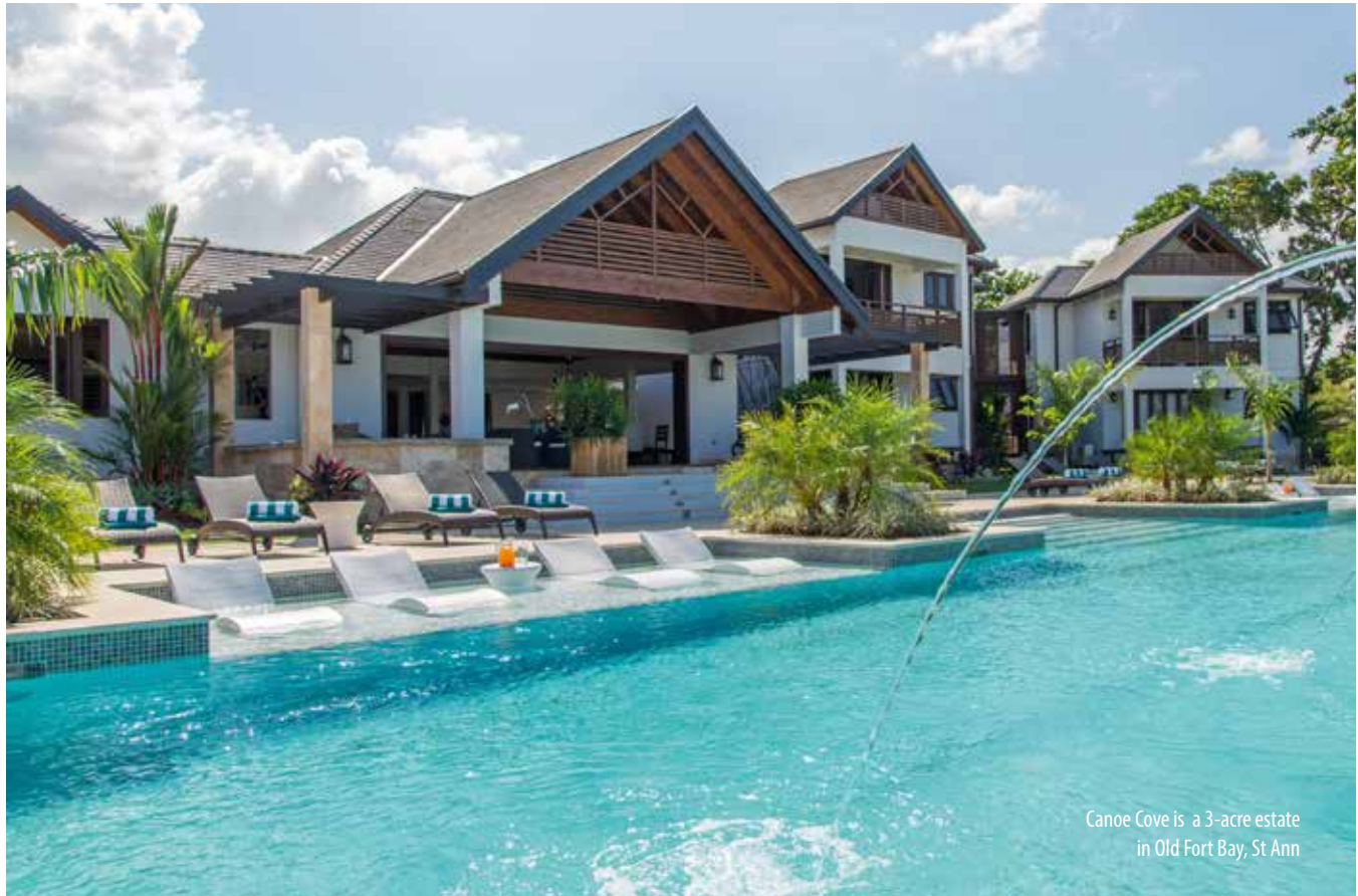
Canoe Cove is a 3-acre estate in Old Fort Bay, St Ann