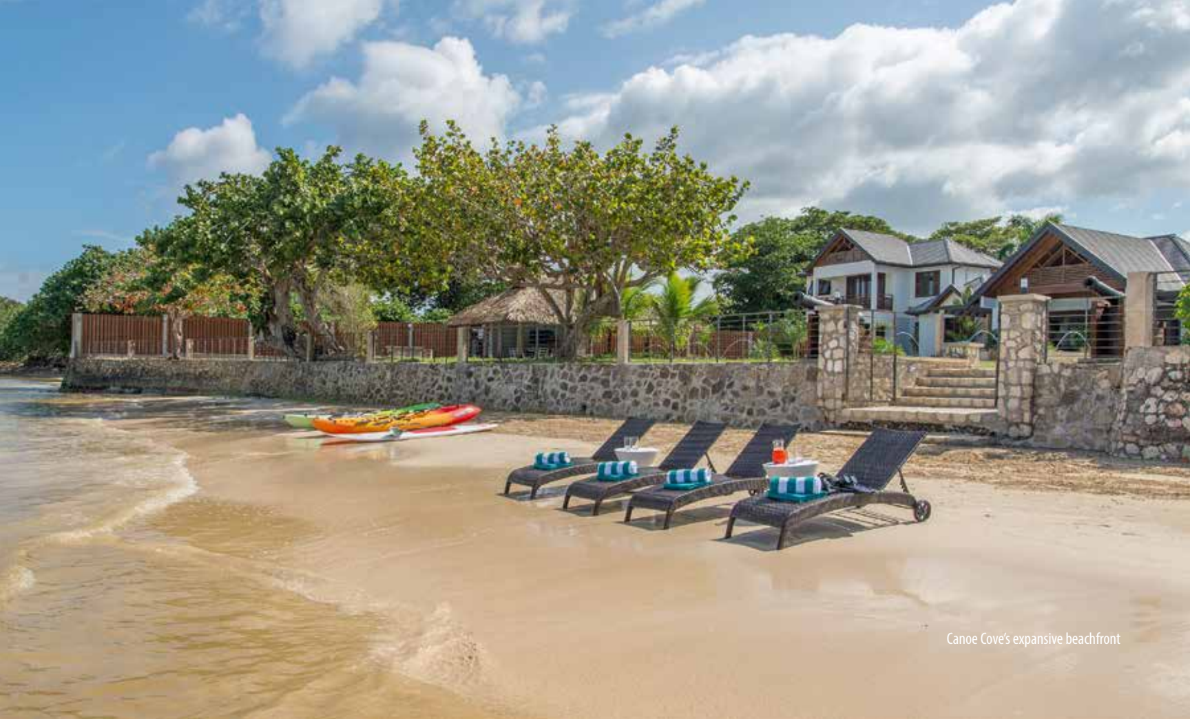
Canoe Cove's expansive beachfront