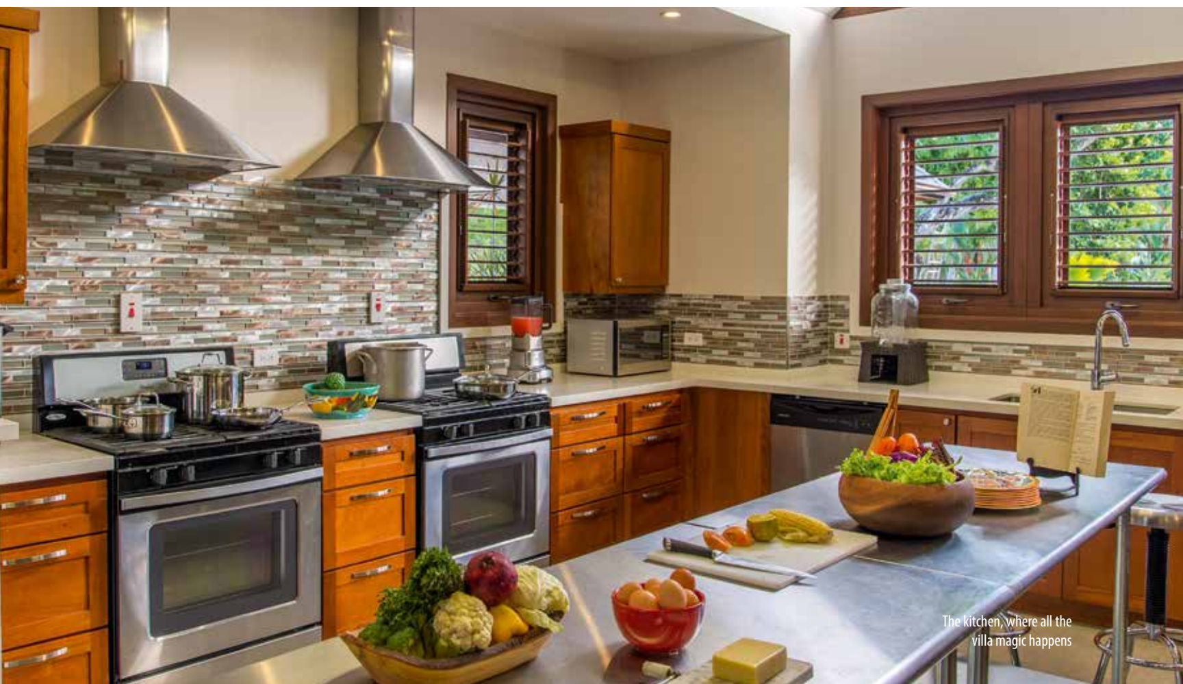
The kitchen, where all the villa magic happens