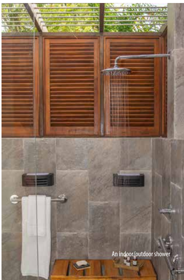
An indoor/outdoor shower

included no “inequality of spaces.” Six of the seven rooms (which feature king size beds, some with large indoor/outdoor bathrooms) face the sea and avoid any typically placed, but often unused, living areas generally found in villas. “The idea was to break the rules of formal spaces,” Subaran states of the architectural challenge Millingen faced. As such, entering the house through the “great room,” the only indoor living/dining space, is more like walking on to a large covered verandah – with no complete walls, awnings (as necessary) for windows, landscaped corridors, artistically inspired grills, and sliding French doors that when slipped one into the other open the front of the house completely to the sea.