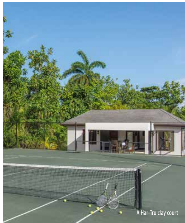
A Har-Tru clay court