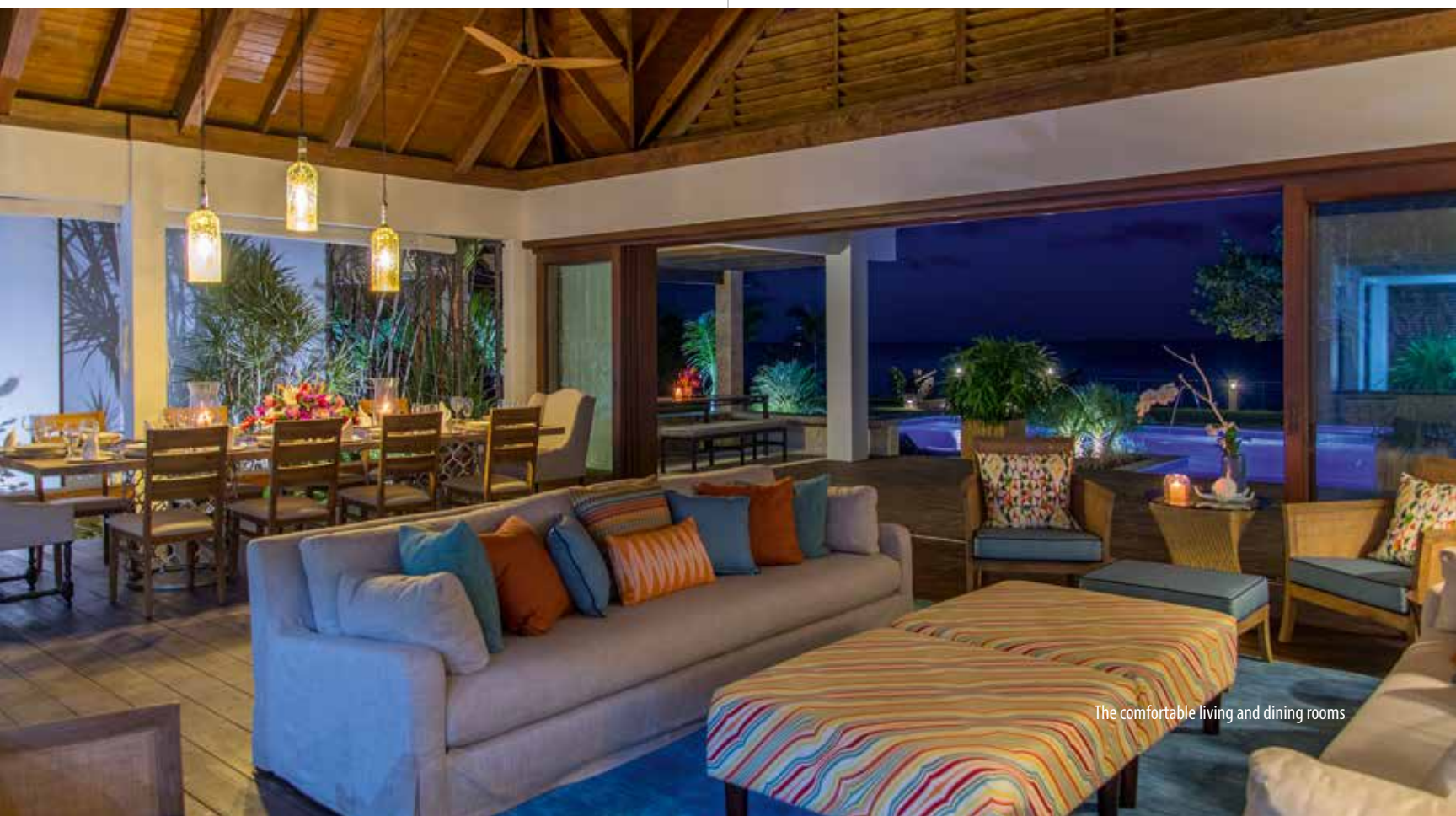
The comfortable living and dining rooms